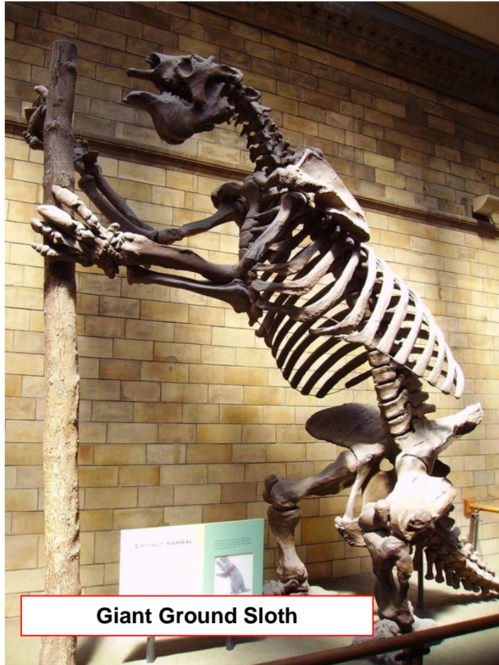
Giant Ground Sloth

Voyage – extension activity, adding quotes and images